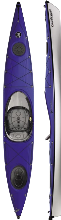
Shown in Airlite

Carolina 12 and 14 available in both Rotomolded and Airlite.